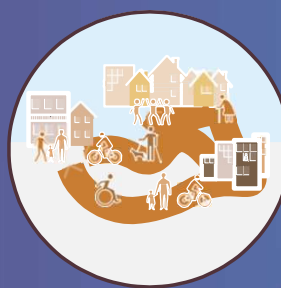
Overcoming Severance with Surrounding Communities