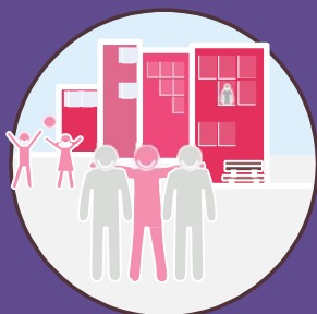
City Centre as an Inclusive Place to Live, Work and Visit