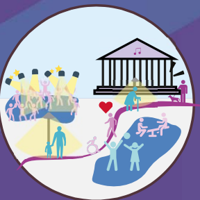
Vibrant and Safe Streets