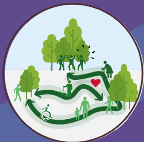
Active and Inclusive Public Realm and Green Spaces