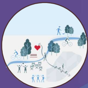
Embracing our Rivers