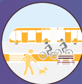
Prioritise Walking, Cycling & Public Transport