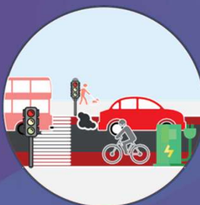
Remove Reliance on Car Travel